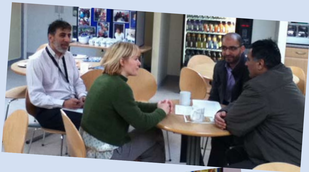
Family network days at Farnham Children's Centre and, below, meeting the bears at Midland Road Children's Centre & Nursery